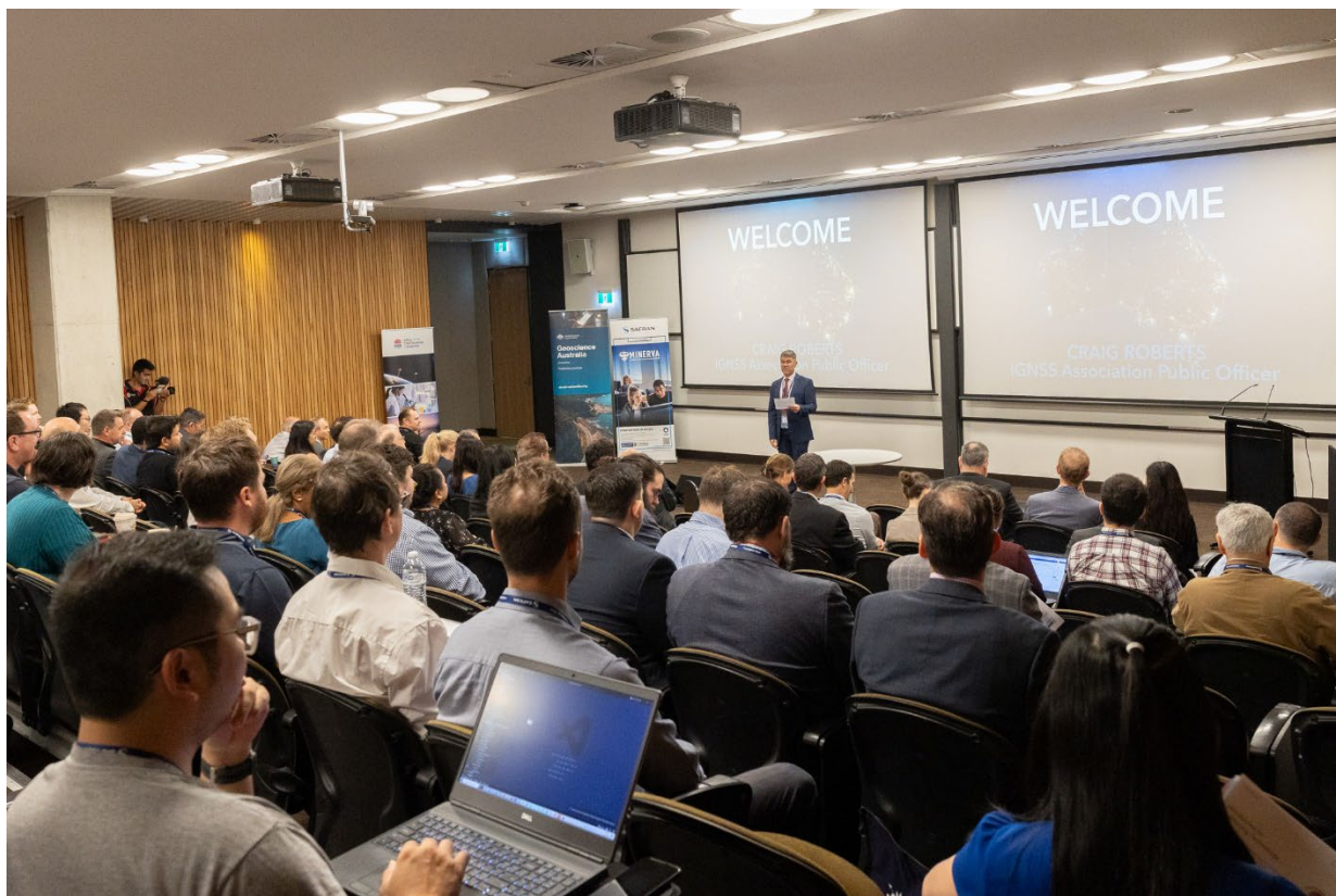
International Global Navigation Satellite Systems - IGNSS 2024

If you have any questions during the application period, please contact us at raap.grants@chiefscientist.nsw.gov.au . OCSE will endeavour to respond to questions within three working days.