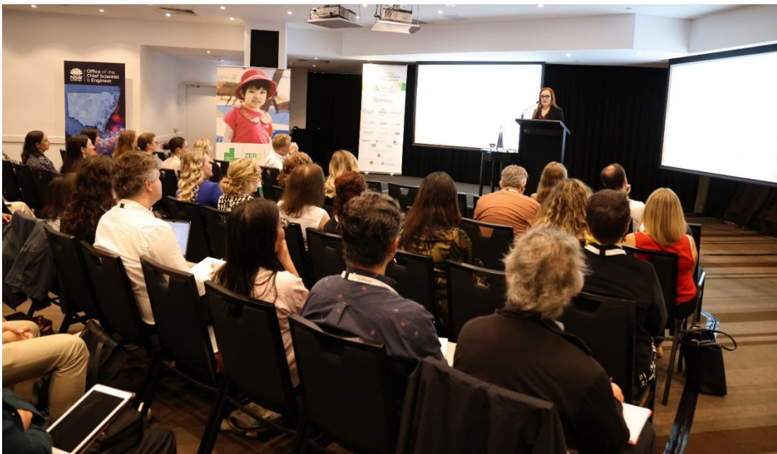
2nd Zero Childhood Cancer National Symposium 2024

If unsuccessful you can submit a new application for a future grant opportunity. Your submission must meet the eligibility criteria and should include new or additional information to address any feedback from your previous application.