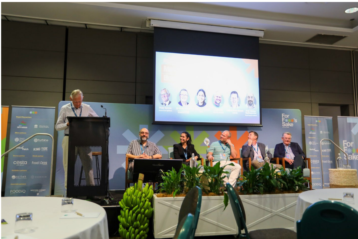
For Foods Sake 2025

The applicant is required to provide a financial acquittal with a final report following the conference, demonstrating that grant funds were used in accordance with program guidelines.