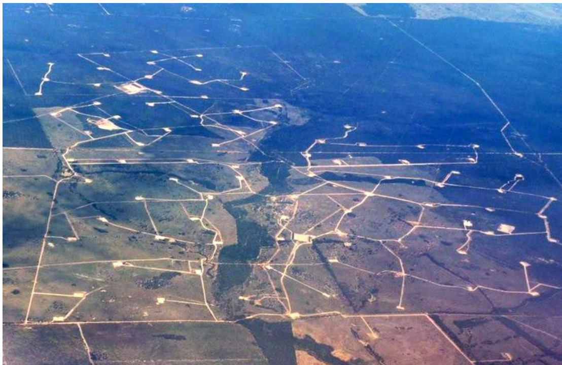
Queensland Gas Fields