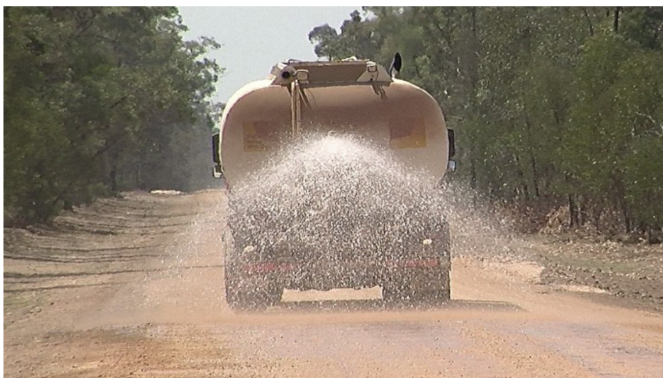
Produced Waste Water used for Dust Suppression

(VOCs). Samples taken from the top of the well-head, a day after the well had been 'fracked', detected VOCs (bromodichloromethane, bromoform, chloroform and dibromochloromethane), as well as benzene and chromium, copper, nickel, zinc. 19