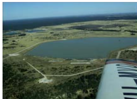
Large Holding Pond