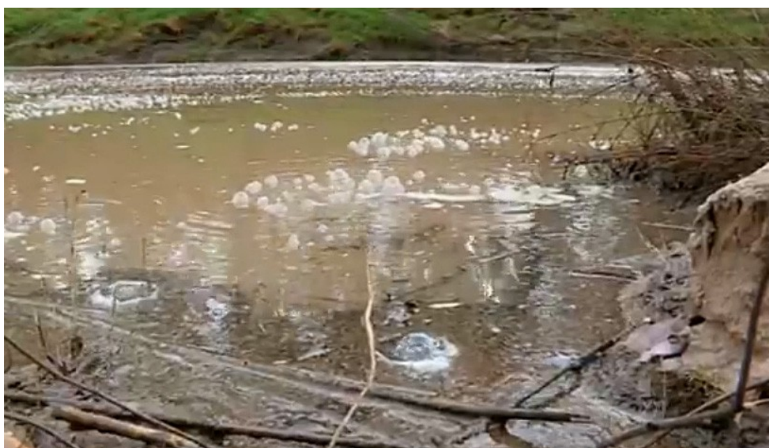
Methane Leaks Bubbling in the Condamine River Queensland

The Health Report acknowledged that industry air monitoring on which it was based had important limitations. The total monitoring period was only nine days, the methodology resulted in limits of reporting for some chemicals that were substantially higher than the reference air quality criteria and that the monitoring was not designed to identify short-term peaks or troughs in air concentrations. The Health Study did not include an assessment of aggregate exposure, of particular concern for the children of Tara. Of the 11 families and 56 people reporting symptoms (headache, rashes, sore eyes, nausea, nosebleeds), only 15 were seen in person by the government appointed doctor.