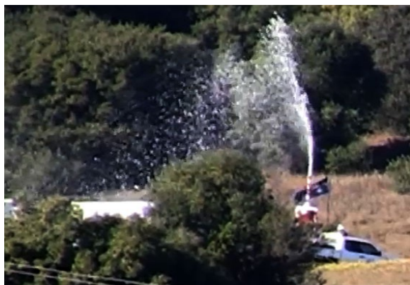
Foam spewing from a CSG well in outer Sydney Australia.

US Health Survey 42 investigated the extent and types of health symptoms experienced by people living near UG in Pennsylvania. Environmental testing was conducted on the properties of a subset of survey participants (70 people in total) to identify the presence of pollutants that might be linked to both gas development and health symptoms. Test locations were selected based on household interest, the severity of symptoms reported, and proximity to gas facilities and activities. In total, 34 air tests and 9 water tests were conducted at 35 households in 9 counties. VOCs were detected in air including 2-butanone acetone, chloromethane, carbon tetrachloride, trichlorofluoromethane, toluene, methylene chloride, dichlorodifluoromethane, n-hexane, benzene, tetrachloroethylene, 1,2,4-trimethylbenzene, ethylbenzene, trichloroethylene, xylene and 1,2-dichloroethane. A range of symptoms were reported in the 108 surveys including nasal and throat irritation (60%), sinus problems (58%), eyes burning (53%), shortness of breath (52%), difficulty breathing (41%), severe headaches (51%), sleep disturbance (51%), frequent nausea (39%), skin irritation (38%), skin rashes (37%), dizziness (34%). While the study did not prove that living closer to an oil and gas facility causes health problems, it did suggest a strong association, as in general, the closer to gas facilities respondents lived, the higher the rates of symptoms they reported.